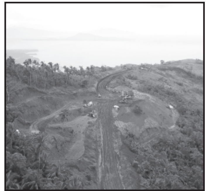
Site of Tower One of the Puerto Galera wind farm project

Puerto Galera needs around 6-megawatt during peak season while the entire province has a maximum power consumption of only 43-megawatt. Clearly, there