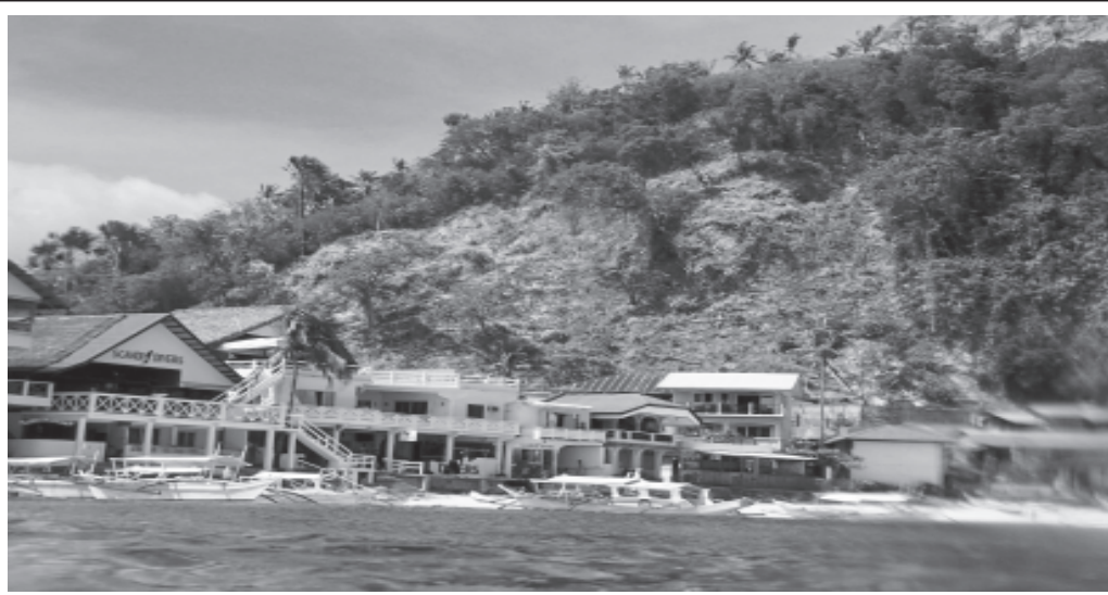
The Fortnightly got some pictures from concerned citizens of Big Lalaguna in Barangay Sabang. Photo show what experts call "dangerous clear-cutting" in eroded slopes near building structures. As expected, the folks around this area are unhappy to see that something like that can still happen in our town.