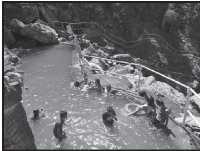
Tourists take a dip at the pool of the new Tamaraw Falls

The job was very clear keep Puerto Galera's listing as a Man and Biosphere Reserve, develop a rehabilitation program for Muelle Bay and the Tamaraw Waterfalls and do all