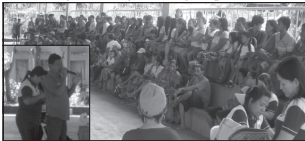
Villaflor residents were consulted by the Barangay Chairman and MENRO officials about the new dumpsite/ sanitary landfill to be built in Pagturian, Villaflor

The disposal of garbage is an ugly battle, not only in Puerto Galera, but all over the world.