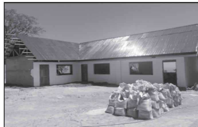
CSR: New community center will be finished this May with a new barangay hall, health clinic and basketball court.