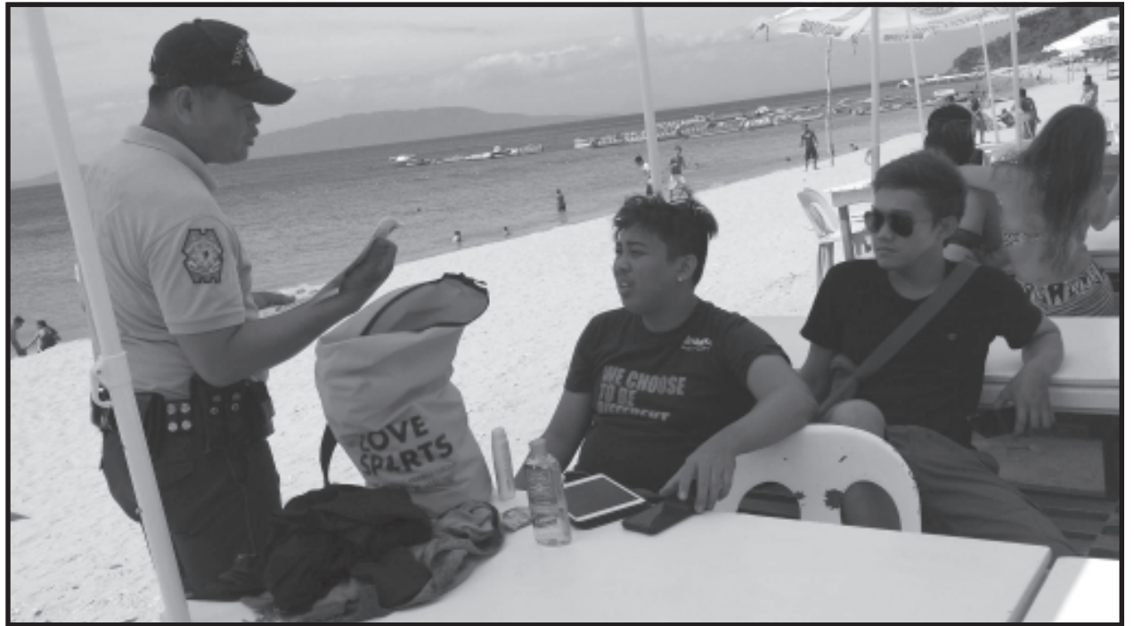
Mga tourist police habang nagpa-patrolya sa White Beach.

Nagtakda ang punong-bayan ng Puerto Galera ng mga bagong regulasyon para sa White Beach ng barangay San Isidro simula ika-21 ng Marso.