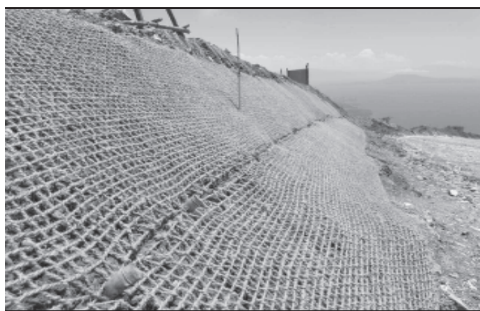
The slope had been laid out with coconut net then hydroseeding and then planting of the anti-soil erosion vetiver grass