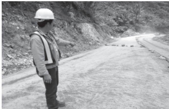
Melekon official said the road will be paved with CTB (cement treated base) and will be 10 meters wide.