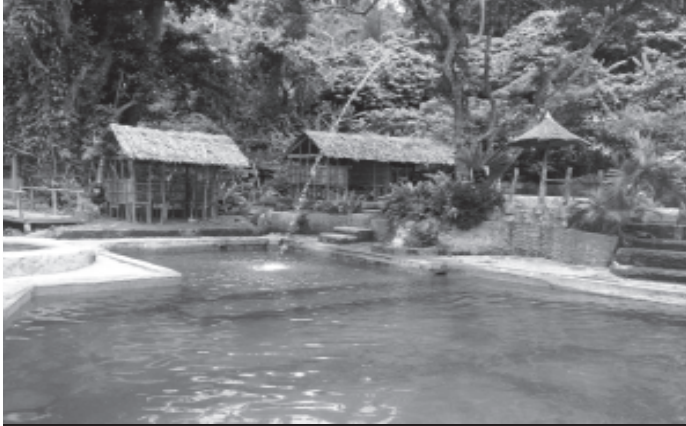
Da Pirmeda resort is expanding with new Mangyan huts and is expected to be a stopover point on the way up to the windmill.