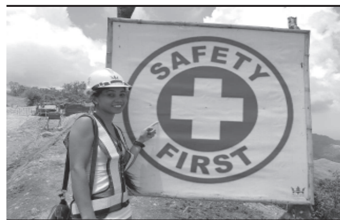
Safety First signages are all over the construction site. Visitors go through a safety briefing before going up the mountain.