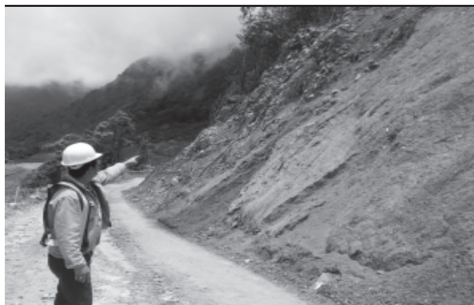
Engr. Poquiz point to a cliff/slope with loose earth and rocks where they will put concrete wall and use concrete blasting.

championing green, renewable energy. But to do this, they need to build the roads which entail lots of clearing, bulldozing and earth-moving causing siltation and pollution albeit temporarily.