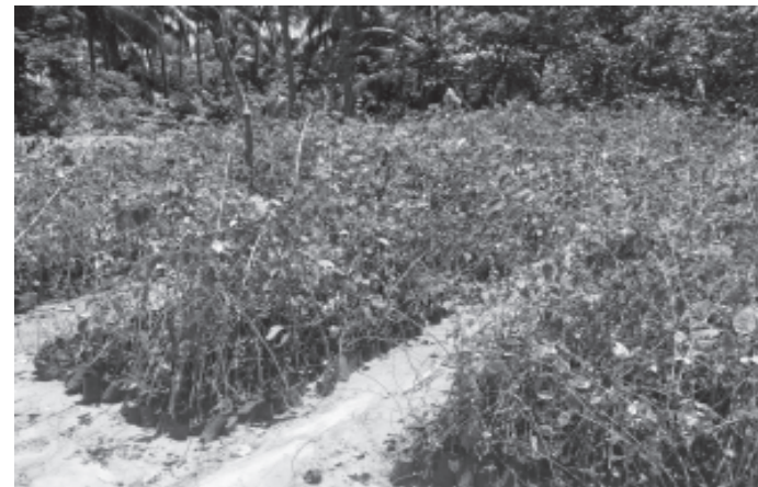
@ the Nursery: 100,000 trees will be planted in a 7-hectare lot approved by the DENR to replace the trees that were cut down.