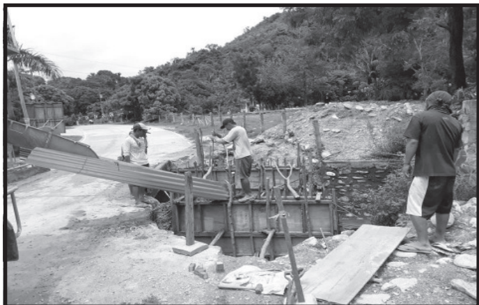
Working on the new bridge at Talipanan, Puerto Galera side