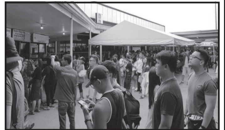
Tourists queue for hours to get on board PG ferries

The operator, our source added, is questioning the correctness of the "market study"