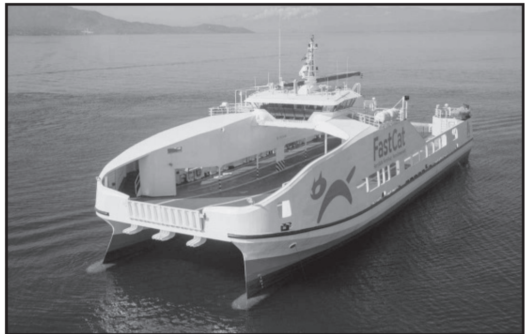
FastCat, a brand new catamaran Roll-On Roll-Off Vessel might soon come to Puerto Galera

The president of the company that operates the fastest Roll-on/Roll-off (RoRo) vessels in the country, said that if it was possible he would have one FastCat ferry providing service for Puerto Galera tomorrow.