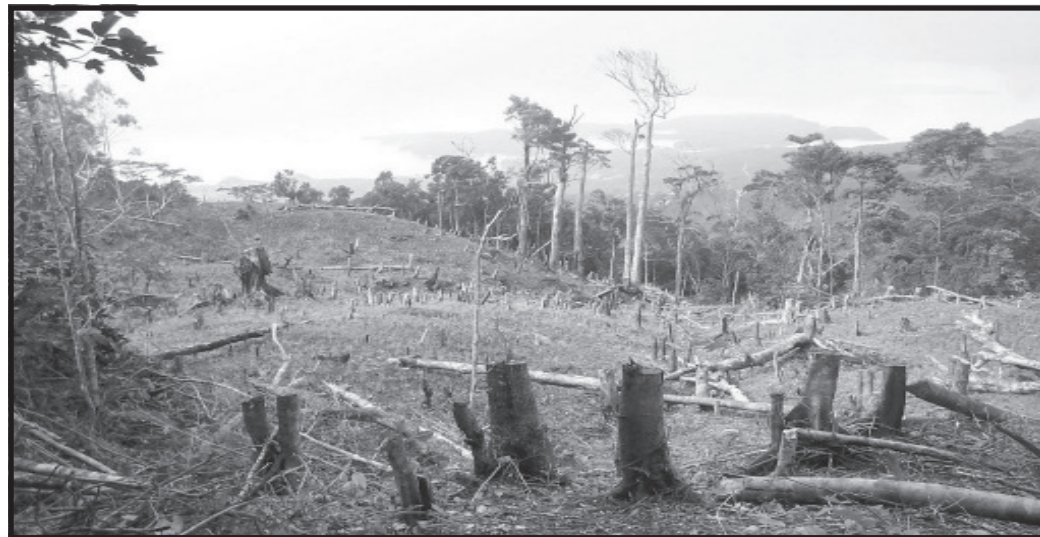
Destroying the rainforest is like killing the goose that lays the golden egg.

just be cut down for firewood or for the charcoal makers because there is nothing else left! Slowly but surely one can now understand and see the bigger and more complete picture.