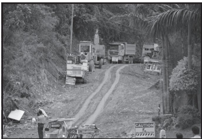
Rapid progress of construction at the Abra de Ilog side