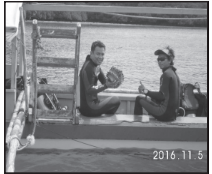
Si Mayor habang nagse-seeding ng baby giant clams sa Tanganan Peninsula sa loob ng Puerto Galera Bay.

Layunin ng proyekto na mag-talaga ng isa pang tourist spot, matapos maging tagumpay at malimit na puntahan ng mga divers ang naunang giant clam project na inilagay sa medyo malalim na