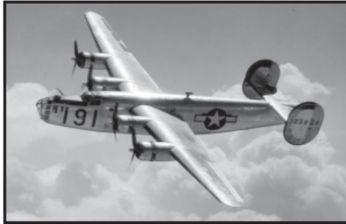
A B-24 Liberator - bomber airplane used in World War II

Well I have had a hard introduction to the demands of finding airplane remains on a mountain. Our Iraya guides were great. They set a cracking pace and we had to stop every 600 vertical feet. Both I and my friend Drew are fit, but climbing