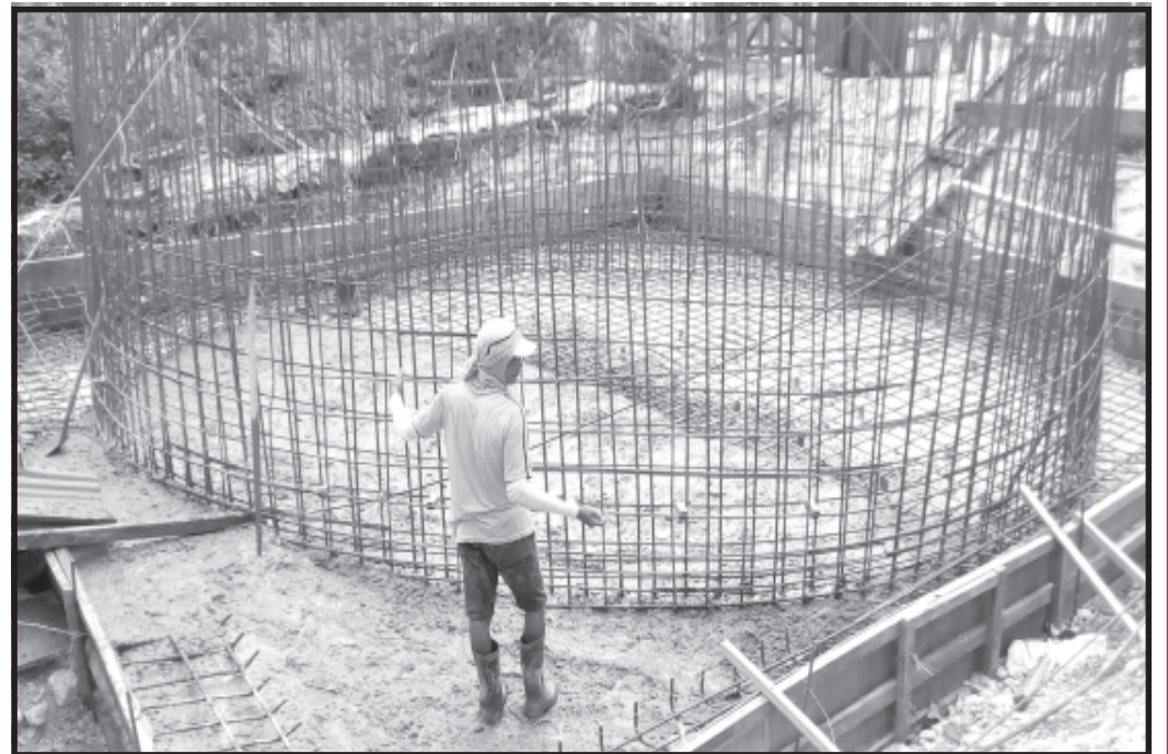
A huge water tank is now being built in Sinandigan for the Sabang-Sinandigan area